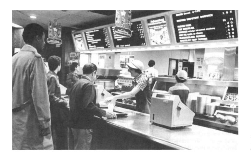
TABLE 14.2Ten Propositions on thePsychology of Waiting Lines

Anxiety Makes Waits Seem Longer Can you remember waiting for someone to show up to meet you and worrying about whether you had the time and/or the location correct? This makes the perceived waiting time longer, because you are worried about whether you (or the person you're meeting) might have made a mistake.